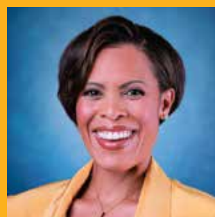
LAURA HARRIS NBC 5